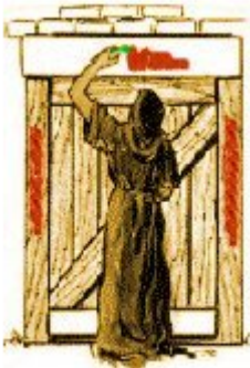
The Blood of the Lamb

The book of Exodus tells us how Moses was sent by God to Pharaoh to be a deliverer of Israel. The Pharaoh, of course, did not heed Moses’ appeal to set the people of Israel free from their slavery, and the stage was then set for the showdown between the God of Israel and the “gods” of Egypt. The final terrible plague that would descend upon the people of Egypt would be the death of the firstborn sons in the land. Only those families that sacrificed an unblemished lamb ( pesach ) and smeared its blood upon the doorposts of the house would be “passed over” ( pasach ) from the impending wrath from heaven.