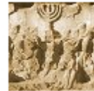
Titus destroys the Second Temple

Tishah B'Av (תשעה באב, the "ninth [day] of [the month of] Av") is an annual day of mourning that recalls the many tragedies that have befallen the Jewish people over the centuries, some of which coincidentally(?) have occurred on the ninth day of the Hebrew month of Av ("Father"). In particular, the following tragedies are all said to have occurred on this day: