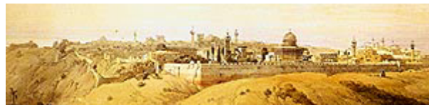
The Jewish Temple was destroyed in 70 AD (see Matt 24:1-2) and has never been restored. All the mitzvot pertaining to the priesthood cannot be fulfilled.

With the destruction of the Temple in 70 AD, many of the enumerated mitzvot that concern ritual and ceremony within the establishment of the Aaronic priesthood can no longer be obeyed (it has been estimated that only about 270 of them - less than 50 percent - are still applicable today). That is, ever since the Diaspora of the Jewish people, it has been literally impossible to fulfill all of the Torah’s righteous demands. Nonetheless, the Rabbinic tradition has assumed the role of interpreting the applicability of Jewish law for the individual Jew, and certain qualifications in the idea of the mitzvot are therefore made.